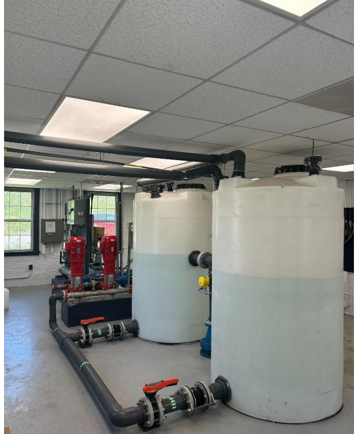
Grindstone Equalization Tanks (prior being pumped into system)