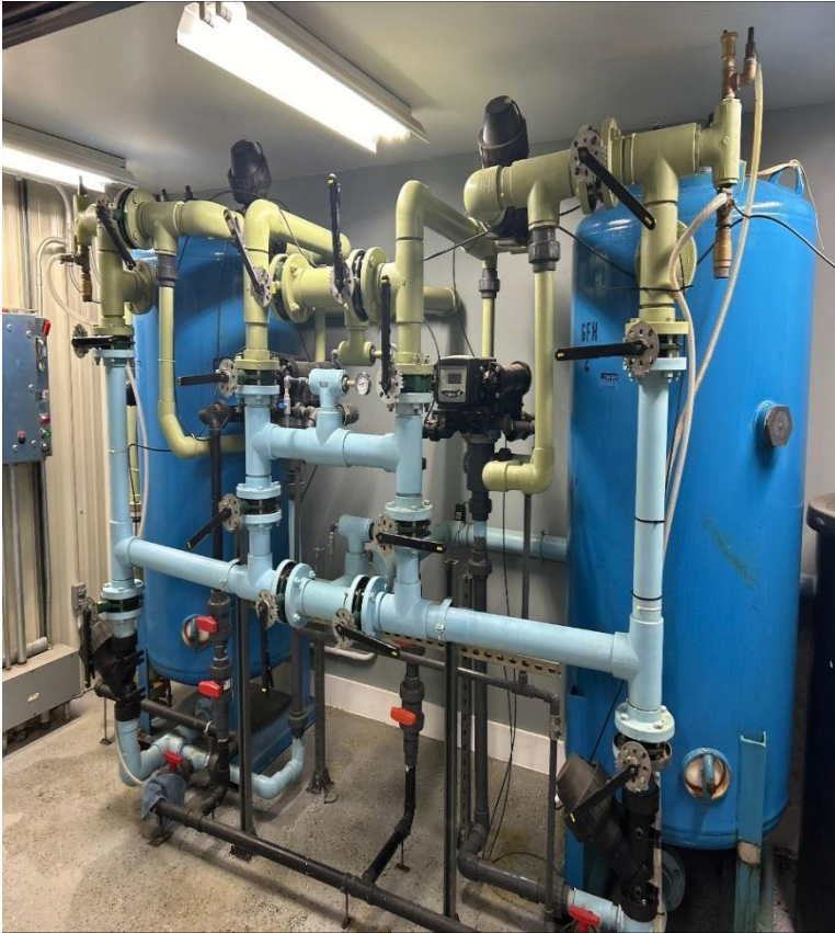
Grindstone Arsenic Removal Media Vessels